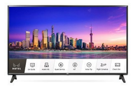
* Based on 32LT660H Specification