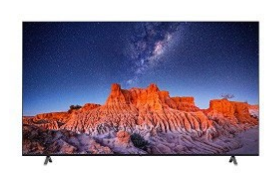
* Based on 75UQ901C Specification