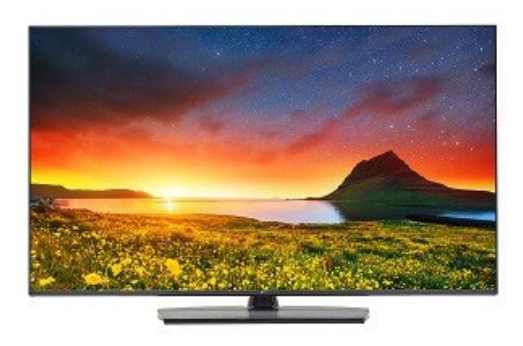
* Based on 75UR765H Specification