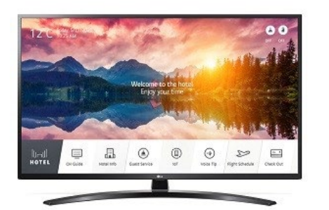
* Based on 65US665H Specification