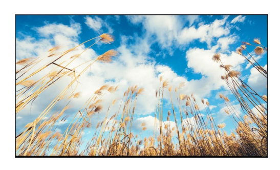
* Based on UM767H Specification