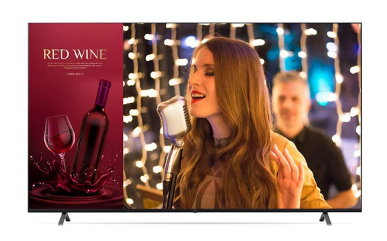
* Based on 86UR640S0TD Specification