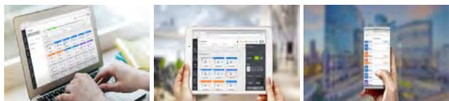
PC : Manager room Tablet : Working space Mobile : Outside