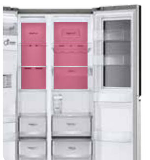
NEW Metal Fresh The metallic finish increases the machine's durability.

The metallic back wall gives the interior a timeless, premium feel.