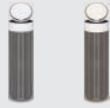
AS55GGWX0 & AS55GGSYO White, Beige (Pet Version)