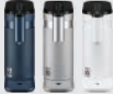
WD516AN Navy Blue, Silver, White