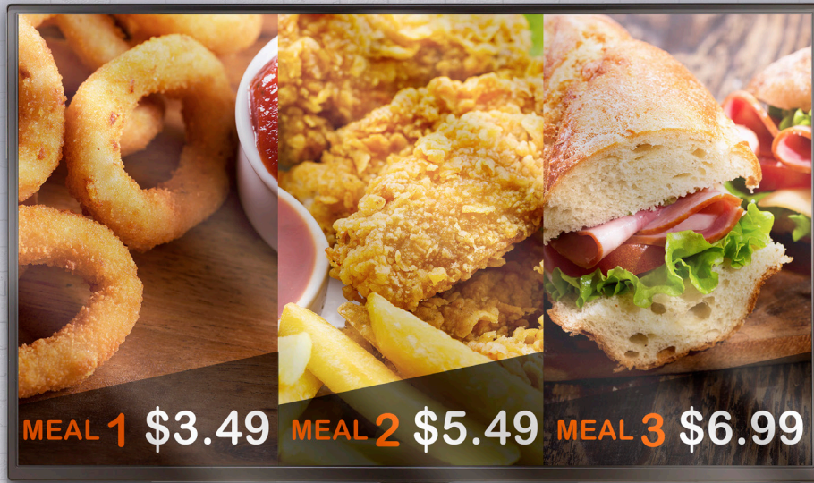
Smart Platform Digital Signage - 55SM5KE