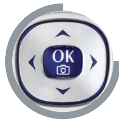
One-Touch Camera Button for Easy Picture Taking

Product features subject to change. Features based on carrier program availability.