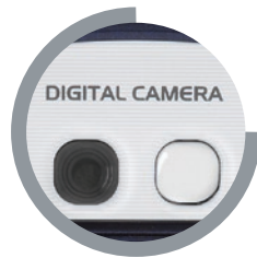
Camera with Built-In Mirror for Self-Portraits