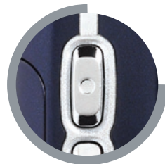
Side Button Triggers Voice-Activated Dialing and Memo Recording