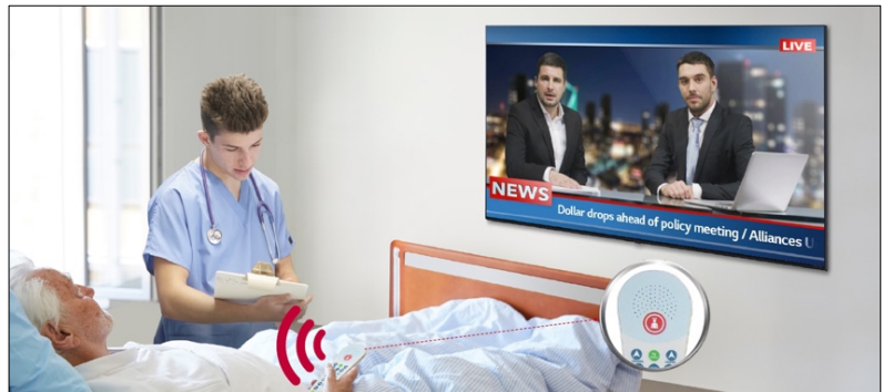
Screen image simulated for illustrative purposes

According to Tom Mottlau, healthcare director at LG Business Solutions USA, the new 75-inch LG NanoCell Hospital TV (model 75UR762M) gives hospital room integrators flexibility when designing new patient interactive systems and is a great choice for those tasked with designing split-screen solutions.